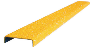
CHANNEL CLEAT SAFETY YELLOW