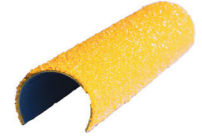
CIRCULAR LADDER RUNG COVER SAFETY YELLOW