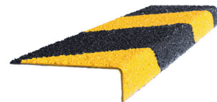
STAIR NOSING BLACK/ YELLOW HAZARD