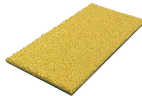
How to Measure Safeplates