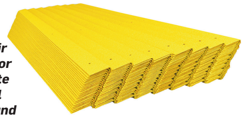
1000 Stair nosings for a mine site in central Queensland