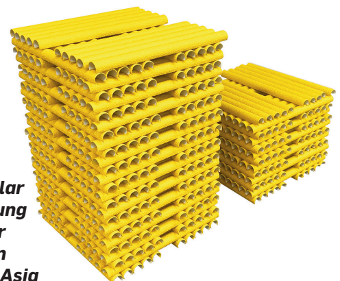
520 Circular Ladder Rung Covers for a vessel in Southern Asia

Stair, step and landing safety is vital for every pedestrian access area. Advance Anti-Slip has non-slip elements to suit every situation.